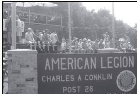
Scottville Clown Band played at the Legion during the Coast Guard Festival