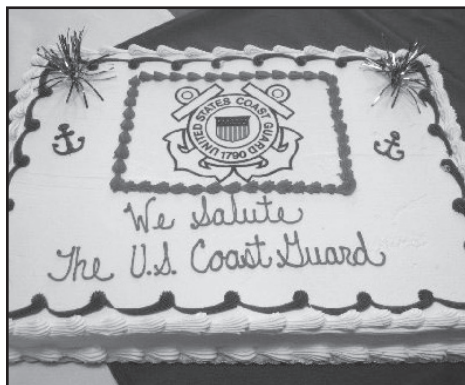
Thanks to our Ladies Auxiliary for the cakes for the Coast Guard Enlisted Dinner.