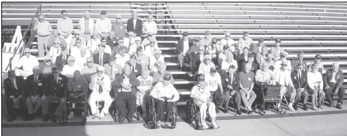
68 WWII Veterans came to the Flag Day Program June 14, 2009 at the waterfront stadium in Grand Haven, MI.

On behalf of the American Legion Auxiliary, I would like to thank the following sponsors of the 2009 Girls' State delegates: American Legion Post 28, Legion Riders, SAL, Rotary of Spring Lake, Grand Haven Bank, JSJ Corporation, Shape Corporation, and Counterpart. Without the support of these organizations and local businesses, we would not be able to sponsor so many delegates each summer. The following young ladies will represent Unit 28 when they attend Girls' State June 21-27 at Michigan State University: