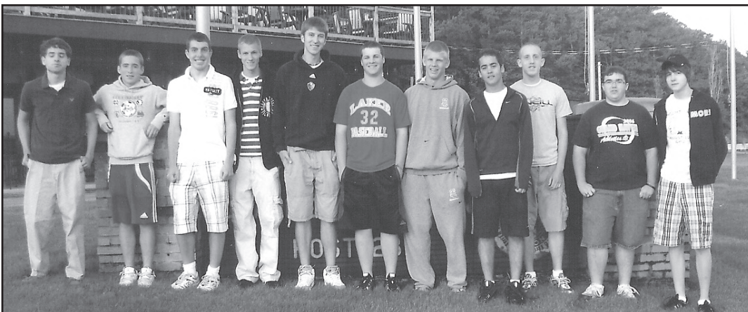
Boys State 2009 Delegates