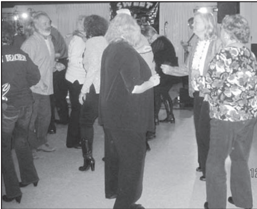
Everyone had a great time at the 2012 New Years Eve party put on by our Post 28 SAL. Another "Great Job" by our SAL Members.