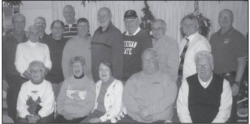
During the Christmas buffet we had a great turn out of our Past, Present Commanders, Presidents and Directors of the Legion, Auxillary, SAL and Riders.