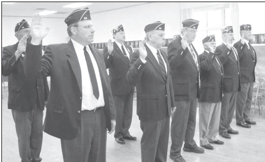
Swearing in of New Legion Officers for 2009-2010