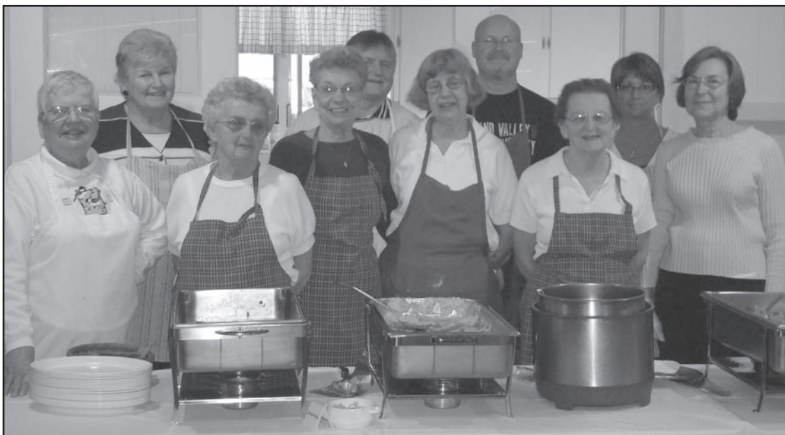
American Legion Auxiliary and SAL prepared and serviced Dinner for 90 th Birthday Party